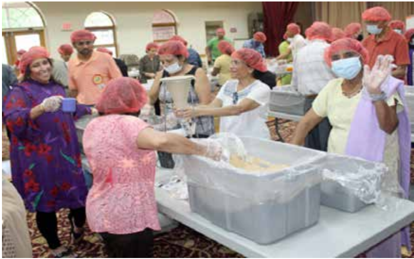
Filling Up Rice, Soybean, Veggies in the Bag thru Funnel