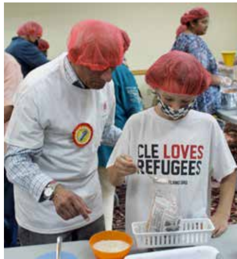
Weighing 380grams on a scale