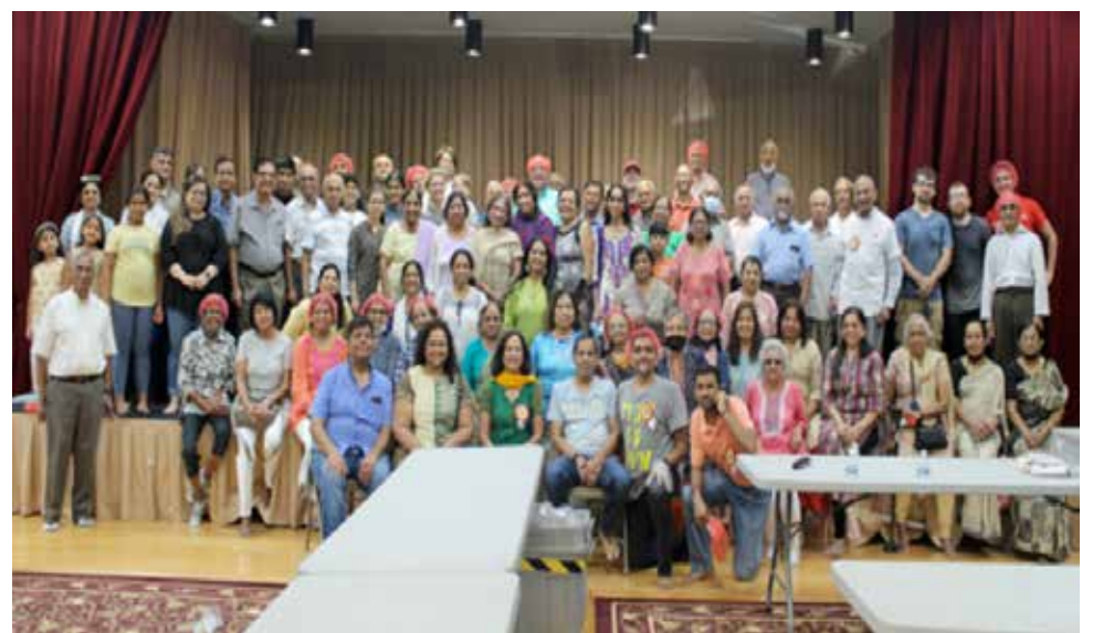
Happy, Enthusiastic Volunteers