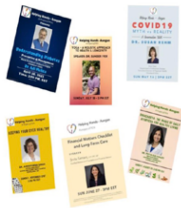
Our Aangan series brought experts to discuss topics of relevance for seniors. The webinars have been well attended and appreciated.

The generosity of our donors continued to be heartwarming. With your donations, we are well on our way towards creating our endowment fund while maintaining enough in operating dollars to meet our yearly service needs.