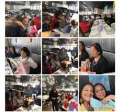
Year-end Helping Hands Board Meeting (+Holiday celebration)!

Notwithstanding the pandemic, our Board members and volunteers got the opportunity to assist several clients in need of help arising from domestic and/or sexual abuse. Sad as it might be, this issue is very prevalent in our community, and the personalized and confidential support we offer has allowed our clients find relevant support services helping them on their way to emotional and financial independence.