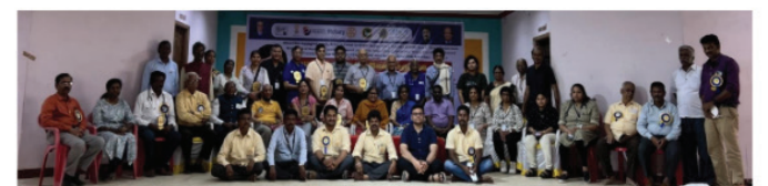
MY2024 & Neyveli Rotary and Lions Teams