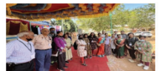
MY2024 & Pudukottai teams